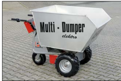
Light cargo tray 450ltr.