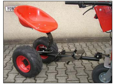
Seat with spring borne and foot service brake