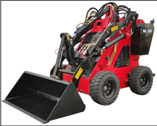
optional with wheels