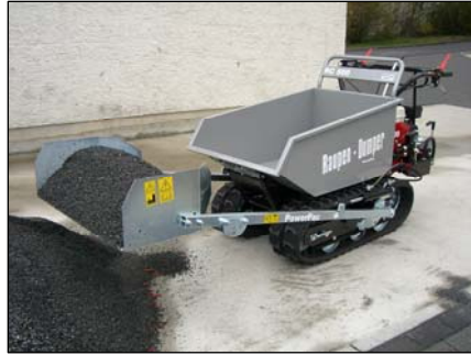
hydr. front loader