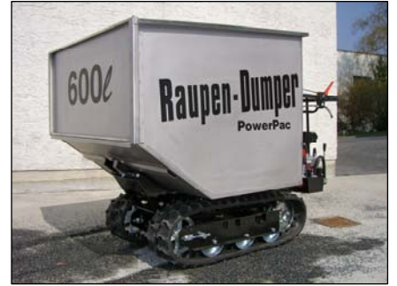
light cargo tray 600 ltr.