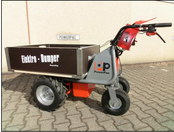
transport platform with adjustable width load carrying beds 90x79x26cm