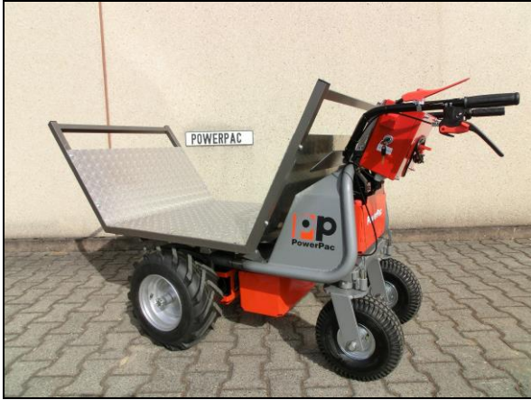
wood carrying platform