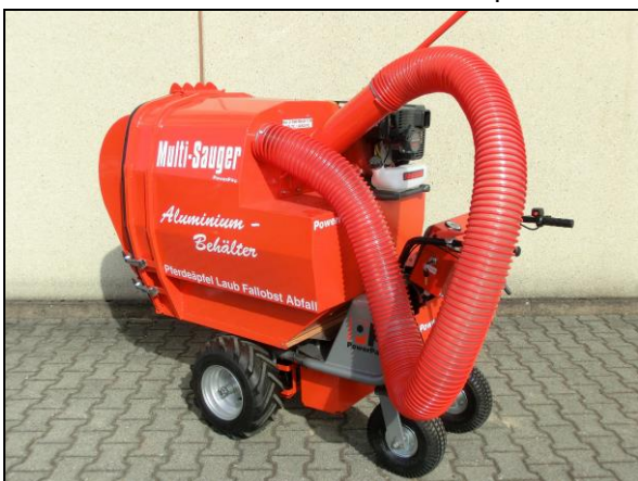
Multi-Cleaner type MCS520 based on MCE400 with a longer frame