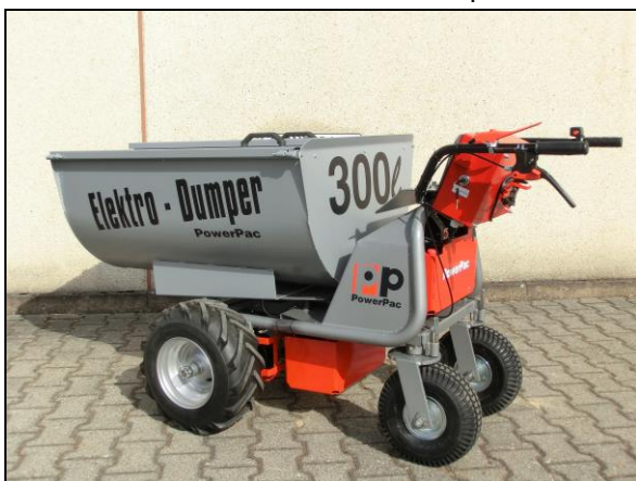
forage / feet tray 300ltr. based on MCE400 with a longer frame