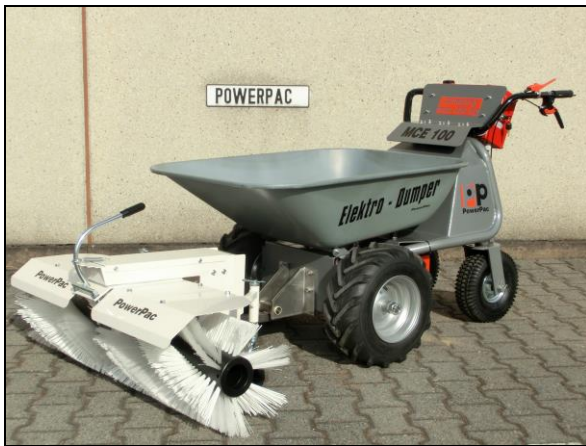
sweeper 105cm - mech. pivoting incl. adapter