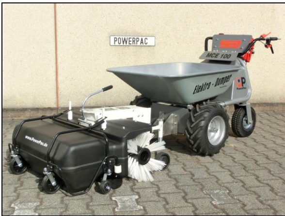
sweeper 85cm - mech. pivoting incl. collector 60ltr. and adapter