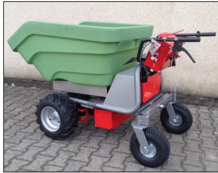
plastic tray massive 350ltr. dimensions: 1140 x 770 x 490 mm