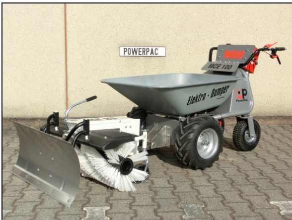
sweeper 85cm - mech. pivoting incl. snow blade 85cm and adapter