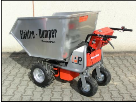
light cargo tray 450ltr. dimensions: 1160x850x565mm